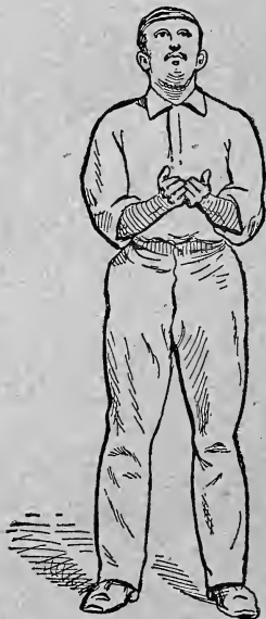
THE SAFE CATCH.

difficult of attainment in fast bowling, but not impossible, even for a large number. As to the benefits of it, they are indubitable. However long a batsman may stay in, as long as the balls come at different speed he cannot afford to relax his vigilance. He never reaches the condition of that peaceful security, free from thought and